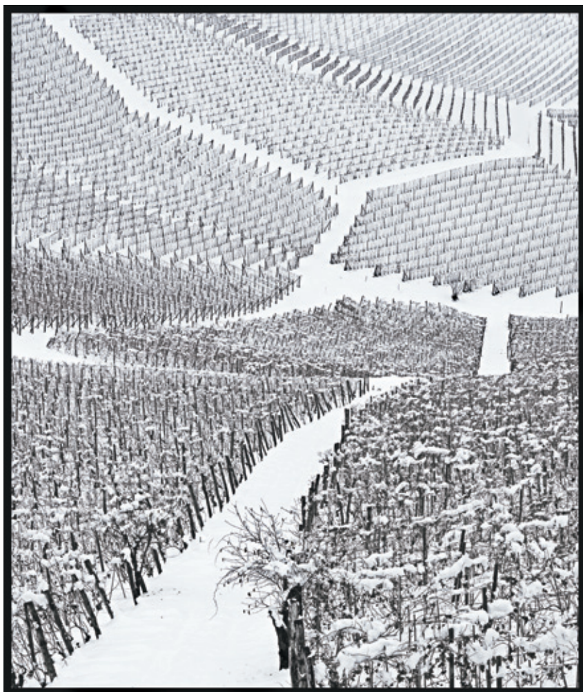
Serralunga d'Alba, December 2017