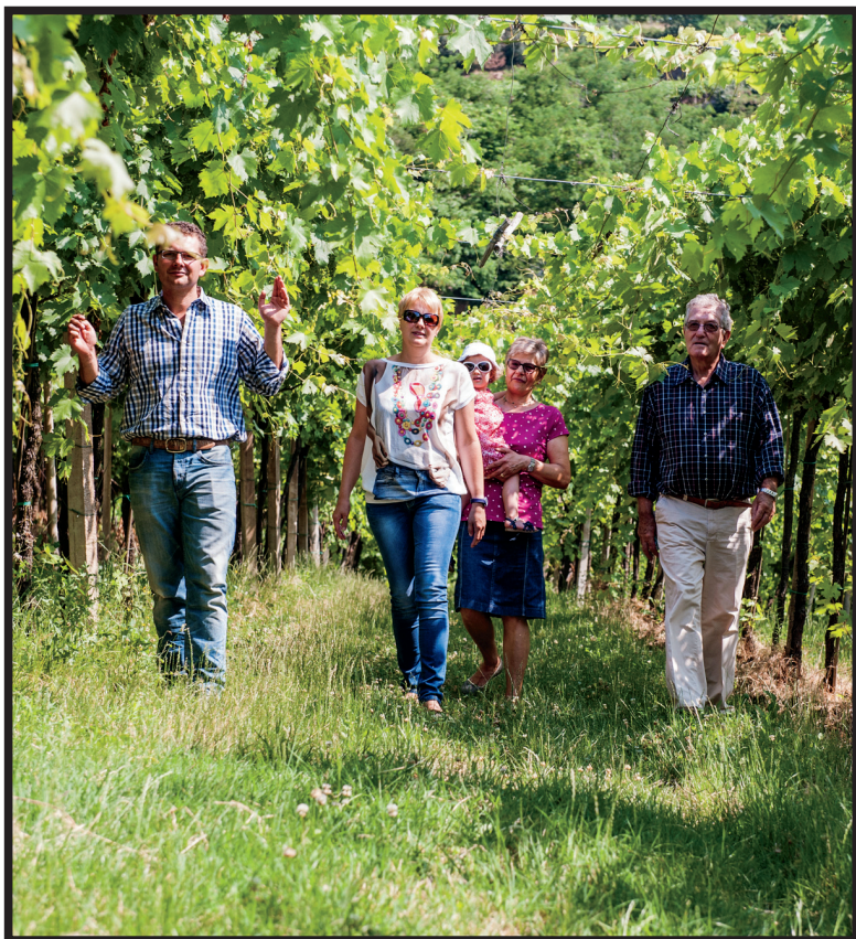
The Vignato family in the pergola-trained vines