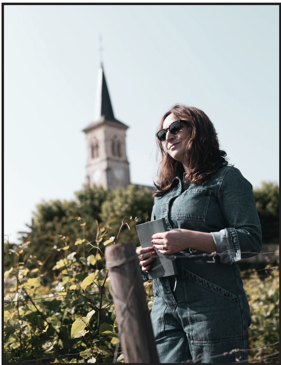
The author in the Clos du Chapitre vineyard