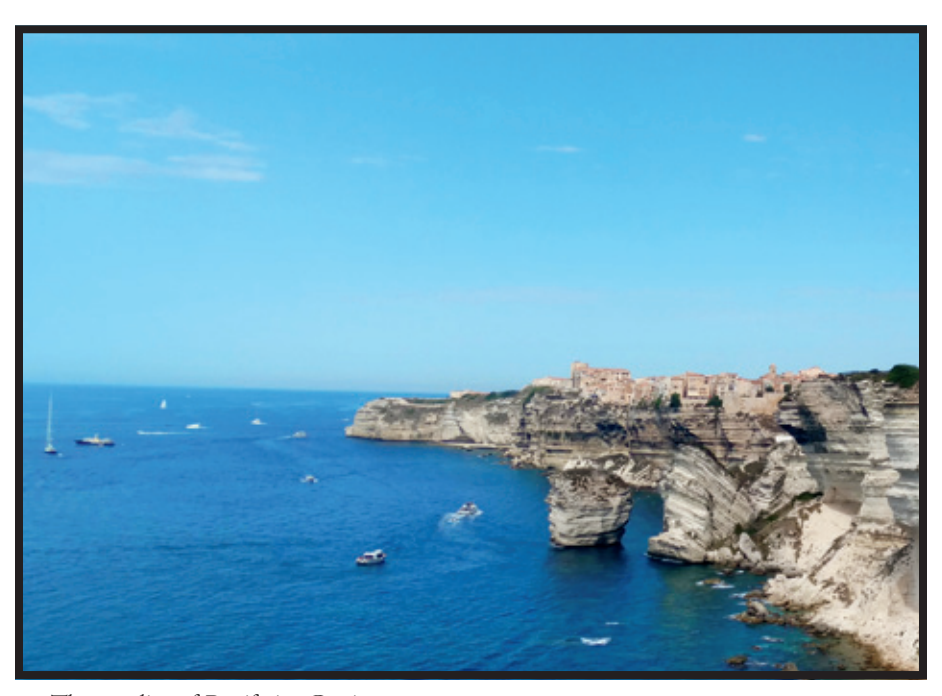
The coastline of Bonifacio, Corsica