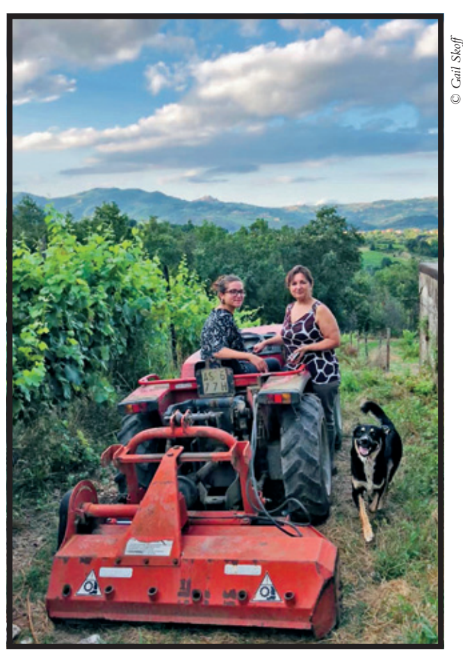
Serena, Diamante, and Brunello of Villa Diamante

NLIKE FRANCE, Italy does not have a Meursault, Alsace, or Hermitage—appellations capable of producing epic, cellar-worthy white wines on a yearly basis. But that does not mean Italy cannot make great whites that stand to improve with time. On the contrary, exceptional terroir abounds on the boot, and individual growers across many appellations carry the flag for excellent bianco . Here are three of our favorites that not only can be enjoyed now, but also will offer many pleasant surprises down the road.