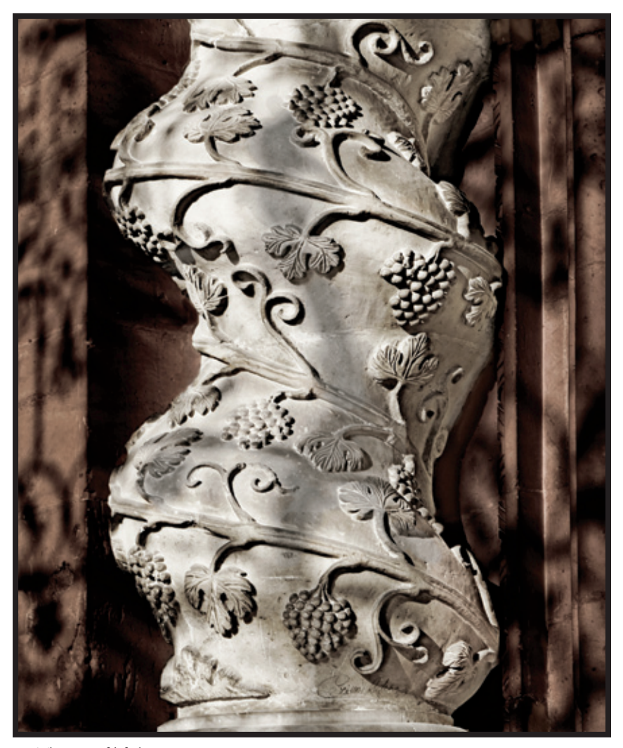
The tree of life has grapes on it