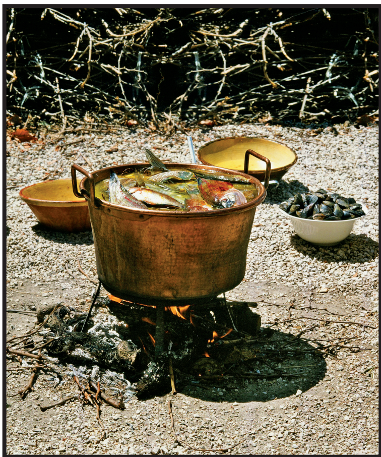
Lulu Peyraud's bouillabaisse

Now through March 5, visit our Berkeley shop or shop.kermitlynch.com/rose and use coupon code ROSE2024 .