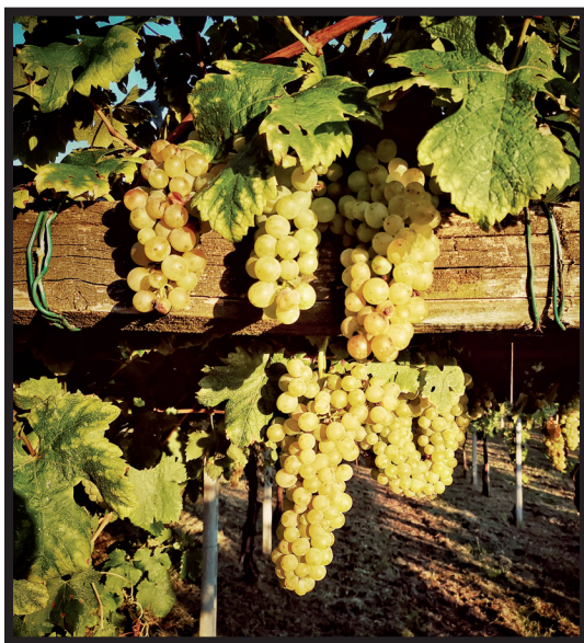
Erbaluce, ready for harvest