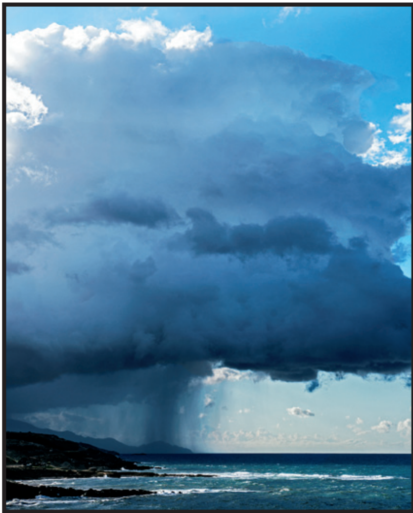
A deluge approaches off the Sardinian coast