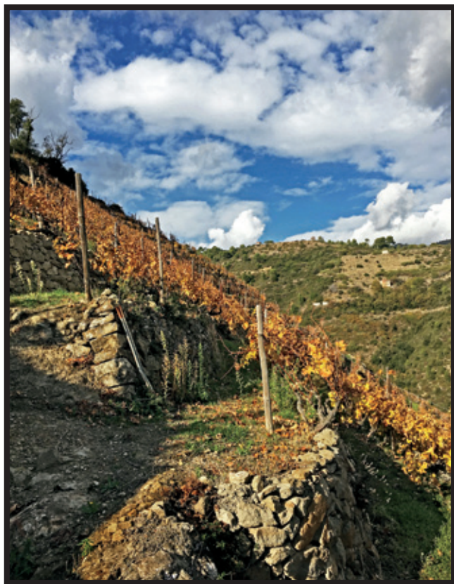
Rossese vineyards at Tenuta Anfosso

W INE IMPORTING comes with its fair share of occupational hazards—air and car travel, food poisoning, overconsumption, exhaustion—but only recently, on a visit to the vineyards of Tenuta Anfosso, did I truly fear the clenched fist of death might strike me down with its morbid wrath. Here in the heart of the Rossese di Dolceacqua appellation, minutes from the Mediterranean coast just east of the French-Italian border, vineyards reach a dizzying grade of 60%, and climbing the near-vertical winding roads to walk the rows felt like quite possibly the last vineyard visit I would live to experience. Côte-Rôtie has got nothing on this, I observed through gritted teeth.