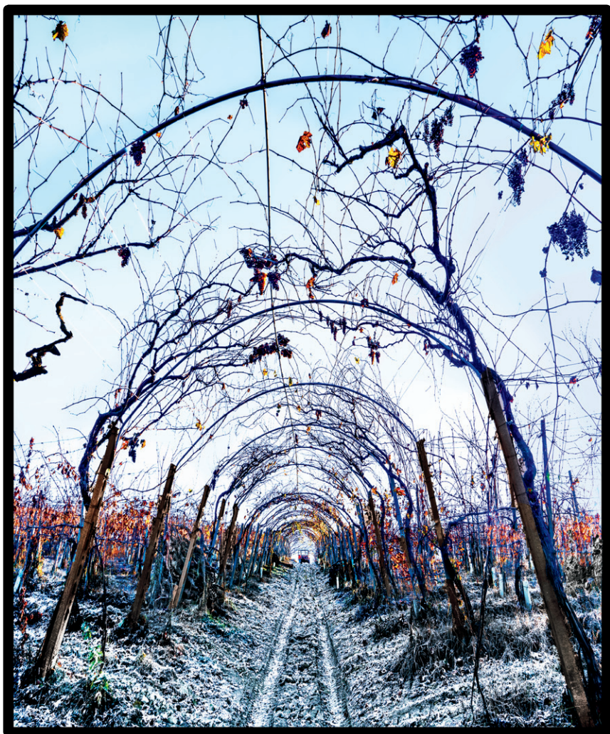
Pergola in Piedmont