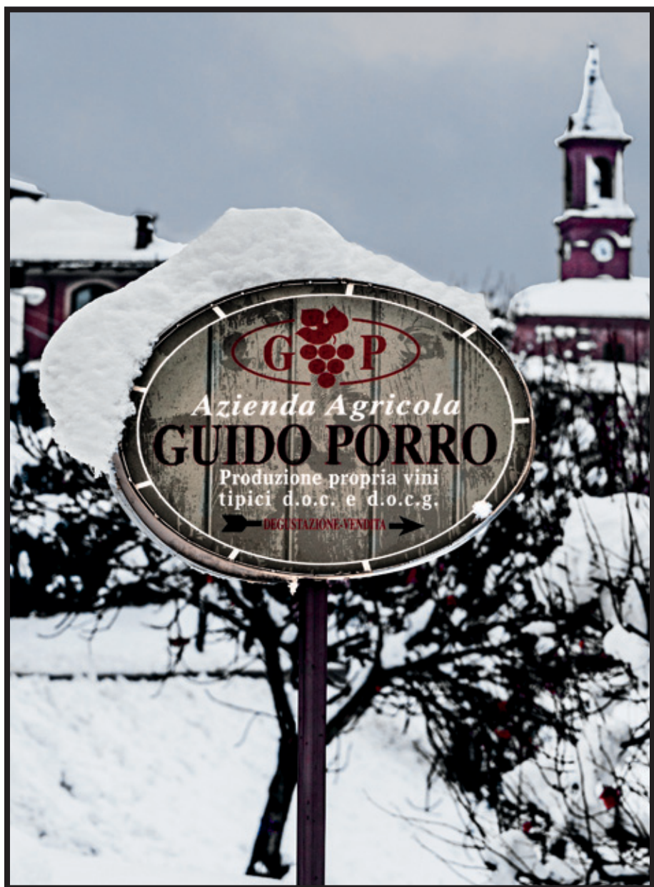
A snowy day in Serralunga d'Alba