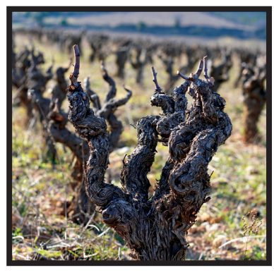
🗅 Les Eminades

Winemaking at Les Eminades is gentle and straightforward, with the goal of expressing the nuances found within Saint-Chinian's fascinating diversity of terroirs through the lens of traditional Languedoc-