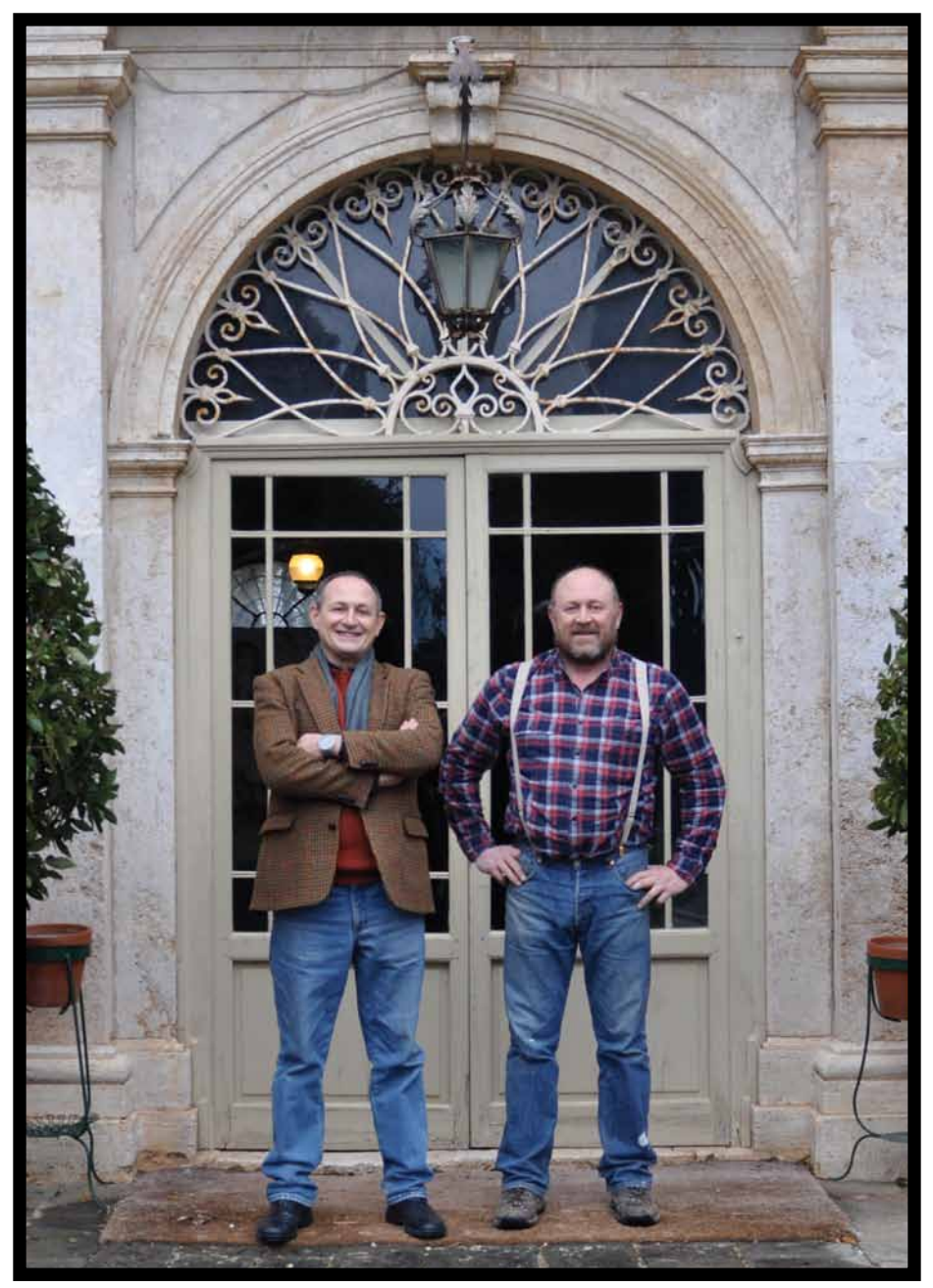
The Bandinelli brothers of Villa di Geggiano