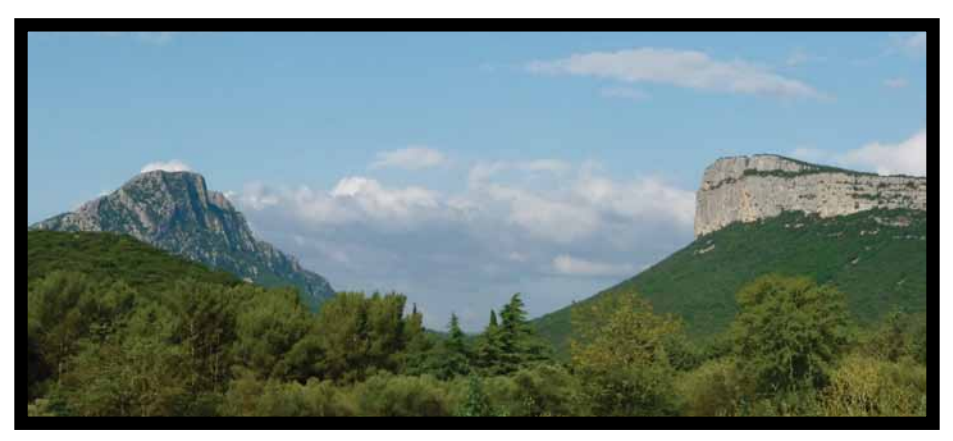
Pic Saint Loup: where that wild Ravaille magic happens