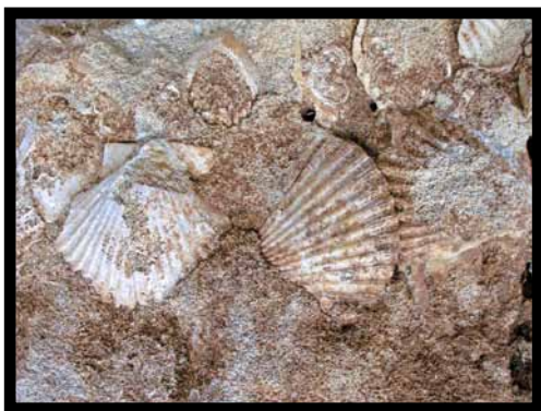
Haut de Carco