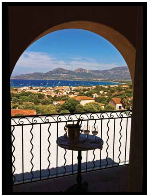
Bay of Calvi

Over the years I have added several Corsican domaines, and this year you'll find two new ones in the shop. Here are some of the exciting bottles now available, along with my notes.