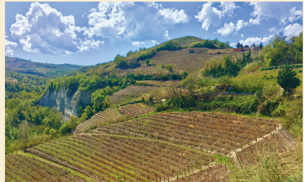
ABOVE Vines at Tintero. COVER Château d’Épiré.

To reorder any of our Wine Club selections, please give us a call at 510.524.1524 to speak to a salesperson, or send us an email at wineclub@kermitylynch.com .