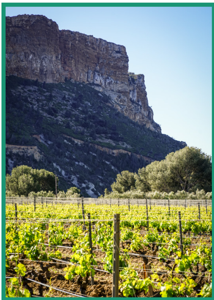
Clos Sainte Magdeleine’s seaside vineyards