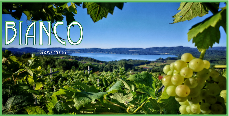
View from Cantina Favaro's vines