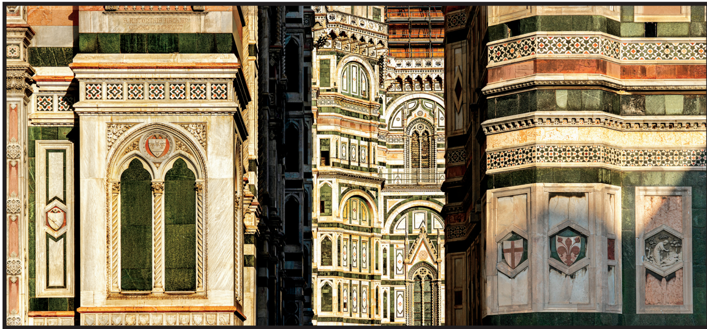
Duomo di Firenze