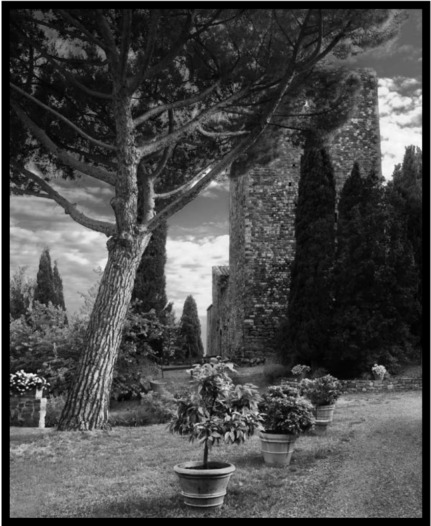
The Sesti estate