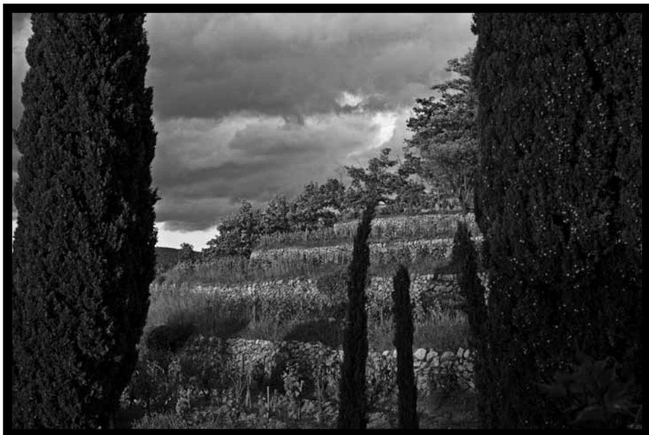
Back in Provence