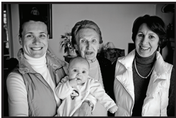
Four generations of Lassalles