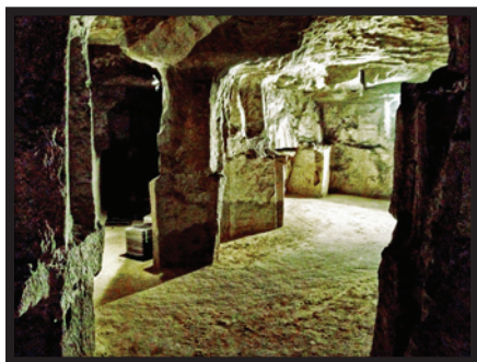
Joguet’s limestone cellar