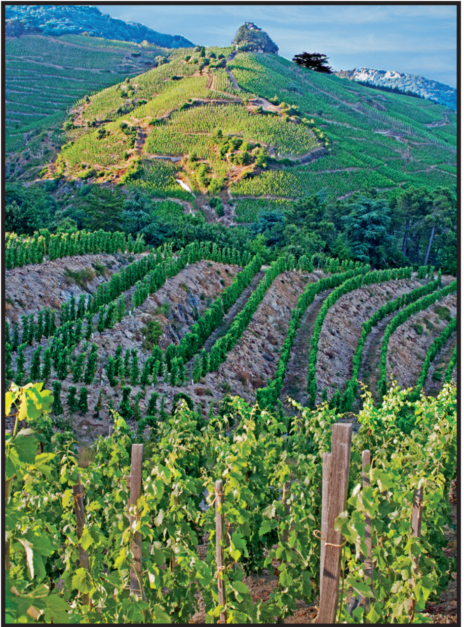
The vines of Auguste Clape