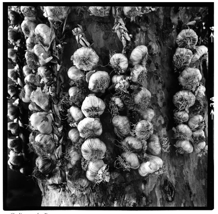
Garlic strands, Provence