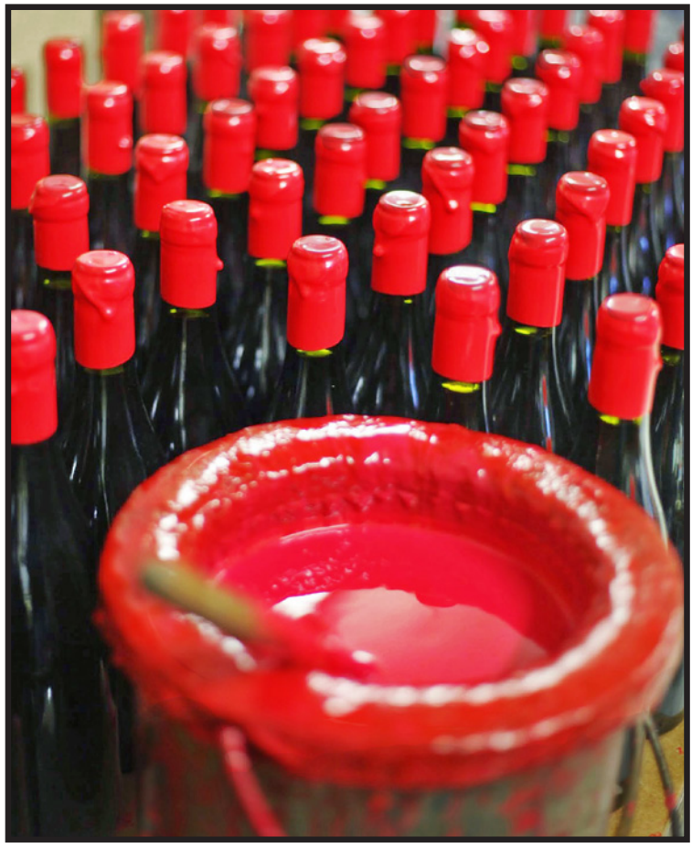
Waxing the bottles chez Lapierre, Morgon