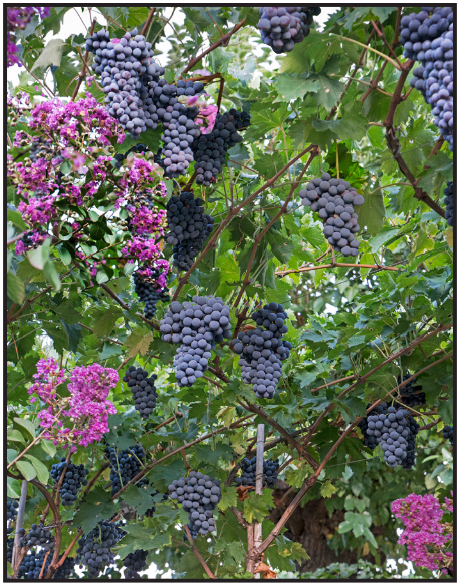
Fabulous 2015 harvest from Quintarelli's vineyards