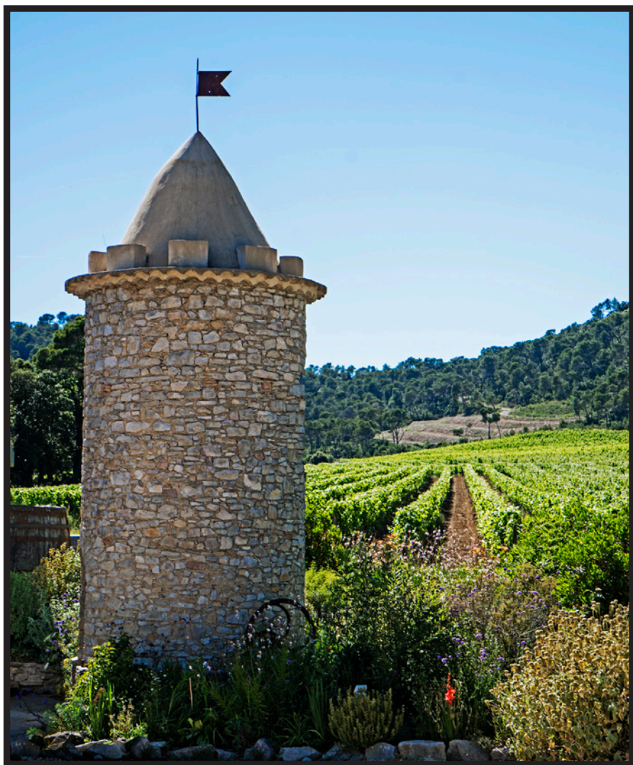
Château La Roque