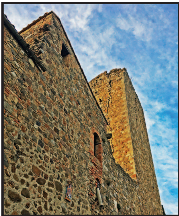
Castello di Argiano