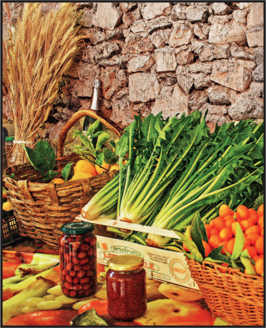
Homegrown produce for sale at Punta Crena