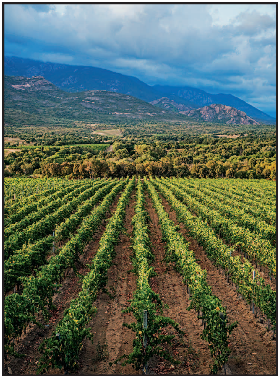
Yves Canarelli's vines