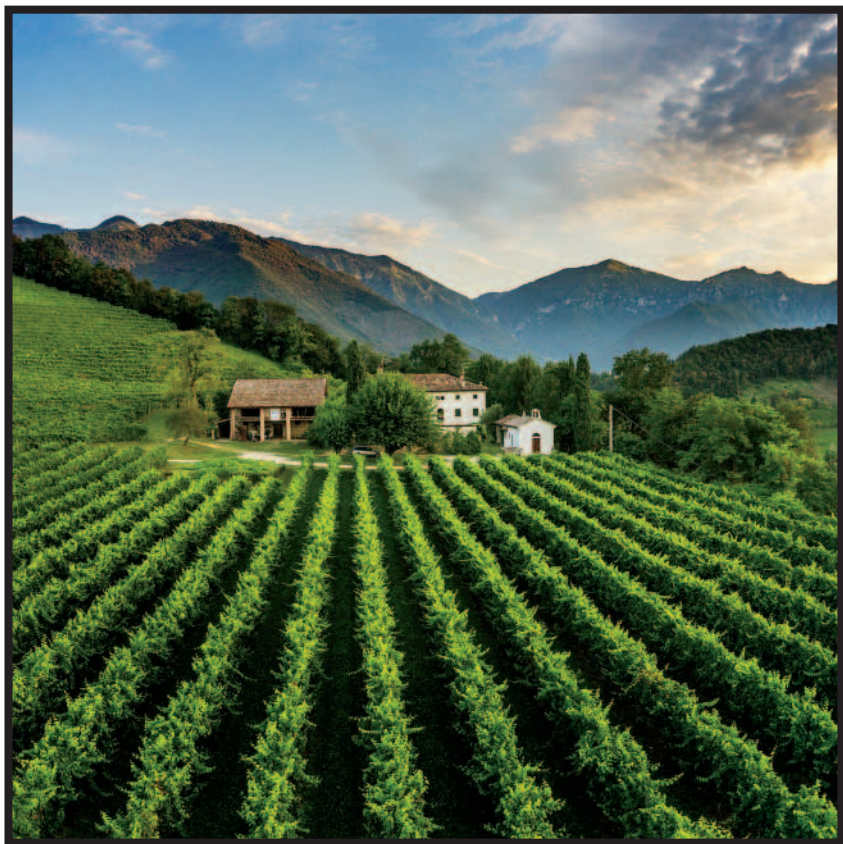
The Gregoletto estate