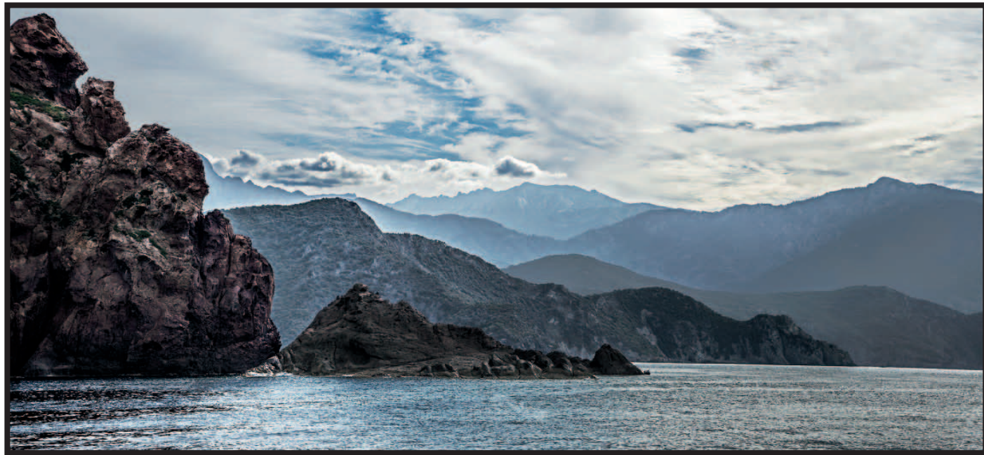
Sailing down the Corsican coast